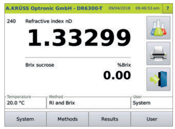
User interface of the DR6000 series

The refractometers of the DR6000 series feature a self-explanatory, user-friendly interface, which makes it easy even for non-skilled personnel to easily operate the device. The user interface is found on all of our measurement instruments so that the user will always be able to work in the same straightforward way and so that integrated solutions with several different devices can be readily realised. A state-of-the-art TFT display ensures a clear, bright representation of all the information and the integrated touch- screen completes the user-friendly experience.