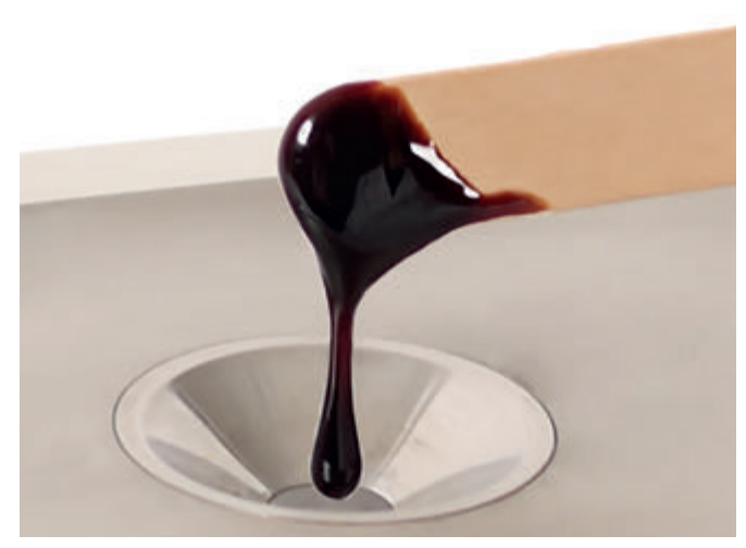
Manual sample supply with DR6000 series

The DR6000 series meets all the requirements of the GMP/GLP incl. international standards and guidelines such as 21 CFR Part 11 (Audit Trail), OIML, ASTM, ICUMSA. Our refractometers are perfectly suited for the use in FDA regulated areas.