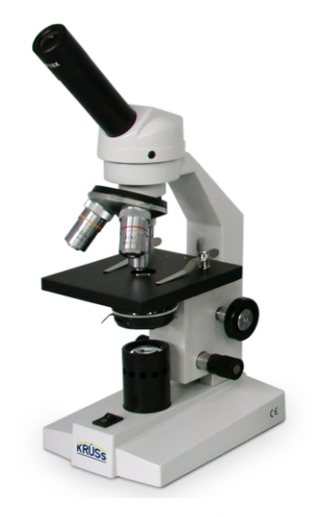
Monocular microscope for lab and educational use

These practical microscopes are great for kids or newcomers. Common for simple laboratory applications, excursion and examination of low-light specimens. These microscopes are very convenient to use, because they usually have a minimum of adjusting screws, so that little can go wrong during use. The single tube is ideal for the eyesight of children, who often find it difficult to look into the microscope with two eyes. Monocular microscopes are small, lightweight and can be flexibly placed anywhere. Therefore, they are ideal for teaching and training in courses. They are also frequently used to make a preliminary selection of specimens that are later to be examined in more detail with high-quality laboratory microscopes.